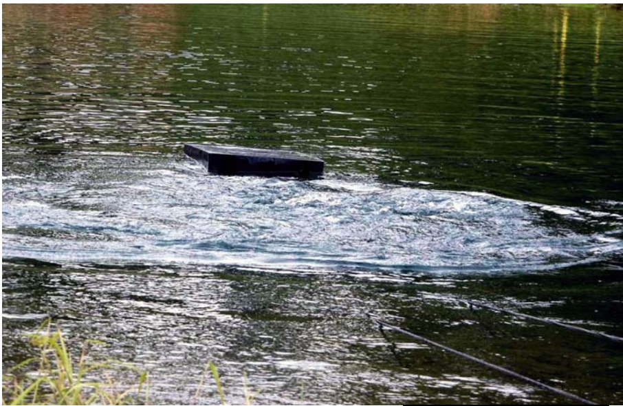
3400CF Water Circulator Creates Directional Flow and Water Movement