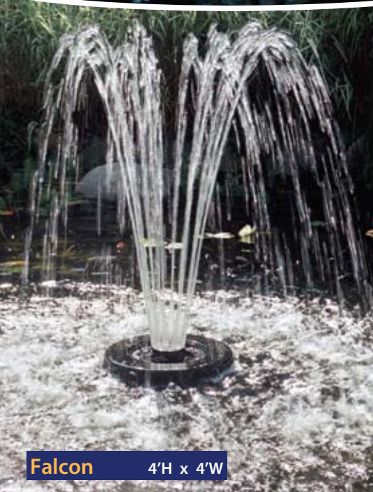
Falcon 4'H x 4'W