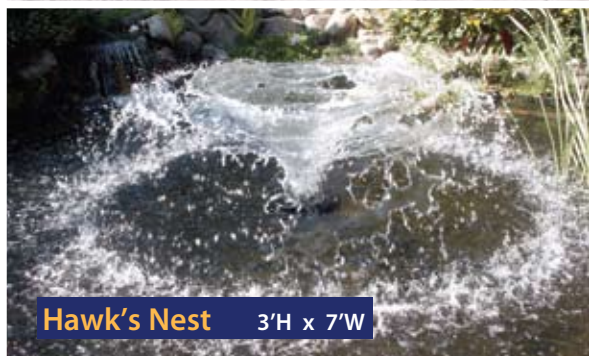
Hawk's Nest 3'H x 7'W