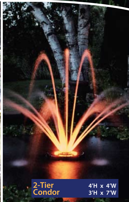
2-Tier Condor 4'H x 4'W 3'H x 7'W