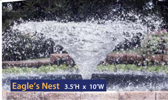
Eagle's Nest 3.5'H x 10'W