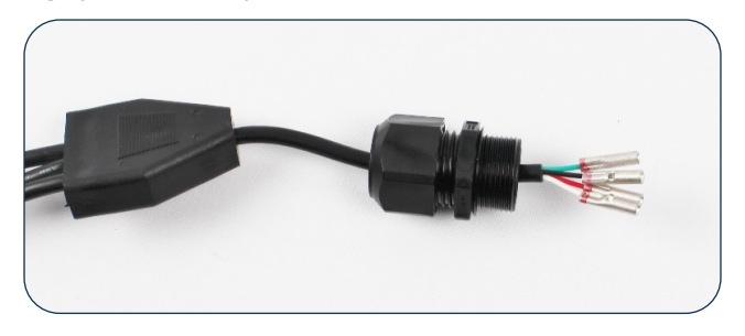
IMPORTANT: Make sure all cord grips and shrink tubing is installed before the final crimping of the cord wires.

6. Slide the small gland cord grip onto the splitter cord.