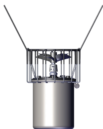
Mooring Ropes (Included)