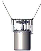
Mooring Ropes (Included)

Secure your Kasco De-icer to a dock or similar structure using the included ropes or optional Universal Mount. Choose depth, angle, and flow of water to achieve desired results. Use an optional U-bolt Kit with the Universal Mount to attach the base plate to dock piling without drilling into structure. See page 63.