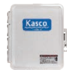
C-220 Timer-Only Control Panel