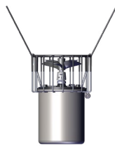
Mooring Ropes (Included)

Secure your Kasco De-icer to a dock or similar structure using the included ropes or optional Universal Mount. Choose depth, angle, and flow of water to achieve desired results. Use an optional U-bolt Kit with the Universal Mount to attach the base plate to dock piling without drilling into structure.