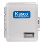
C-220 Timer-Only Control Panel