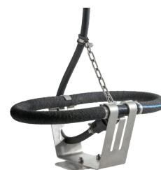
Kasco Single-loop Diffuser