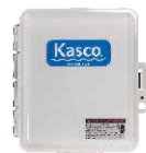
C-220 Timer-Only Control Panel