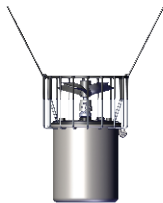
Mooring Ropes (Included)

Secure your Kasco De-icer to a dock or similar structure using the included ropes or optional Universal Mount. Choose depth, angle, and flow of water to achieve desired results. Use an optional U-bolt Kit with the Universal Mount to attach the base plate to dock piling without drilling into structure. See page 63.