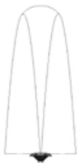
Spruce 21' H x 10' W