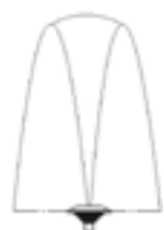
Birch 11' H x 10' W