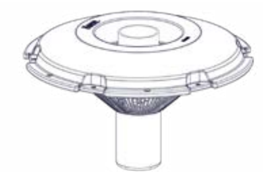
Dimensions Float diameter: 43" Unit height with float: 22.75"