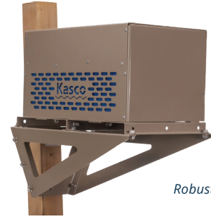
RobustAire™ Small Cabinet Mounting Bracket

The table below lists accessories and replacement items available for RobustAire™ and Home Series Diffused Aeration Systems.