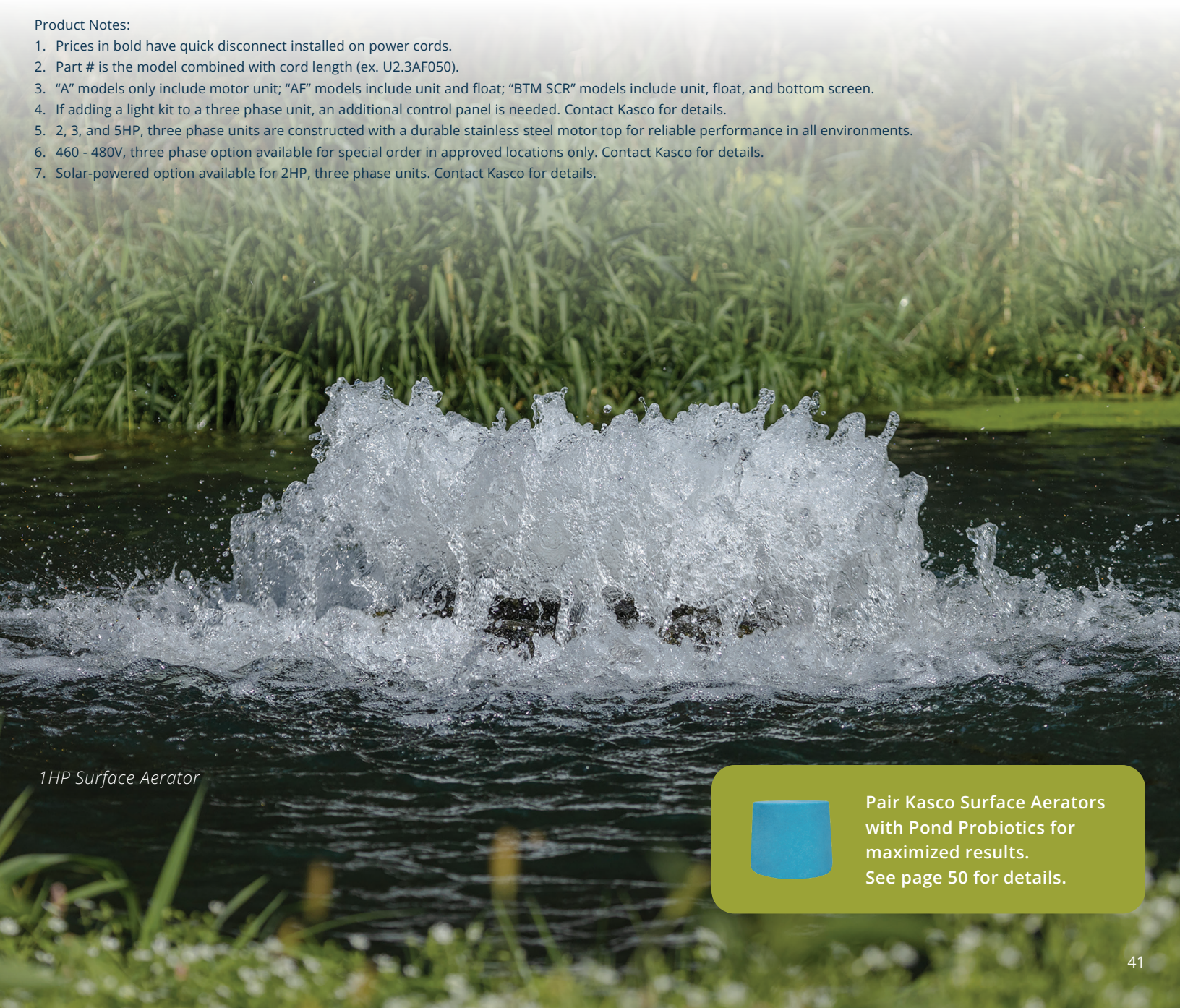
1HP Surface Aerator